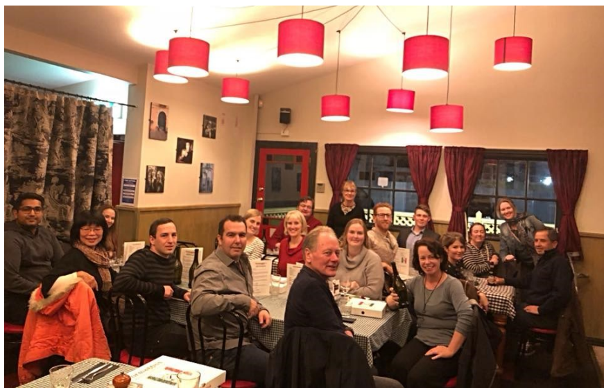
Christchurch Toastmasters AGM - May 2018